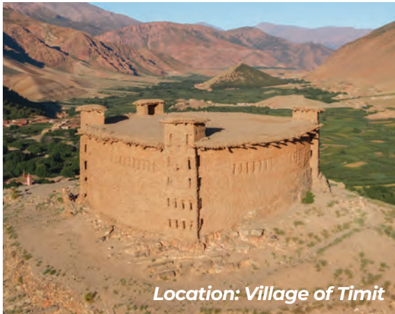
Location: Village of Timit