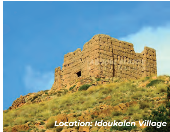
Location: Idoukalen Village

The collective granary of Sidi Moussa, a UNESCO heritage site, and the granary of Sidi Chita offer a breathtaking view of the mountains and the valley! These circular constructions, more than 300 years old, were fortresses used to store crops and valuable goods, as well as shelters to defend against invasion from enemy tribes. A comfortable trail will lead you from the villages of Timit or Ichougane to the Sidi Moussa granary. You can visit the granary and its small museum, enjoy a cup of tea prepared by the caretaker, or have a picnic on-site.